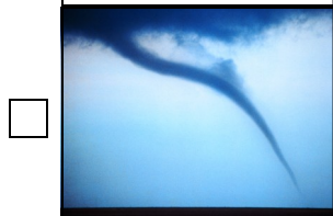
Tornado & Thunderstorm