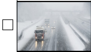
Blizzard & Extreme Cold