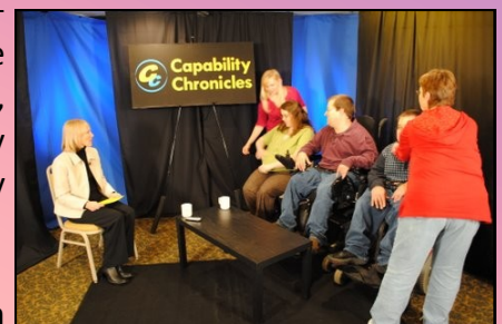
On the set of Capability Chronicles.

This disability awareness program has various half hour segments, which were filmed in the summer and fall of 2010. The Capability Chronicles is focused on featuring different subjects that are important to all and have thus far included: performing arts, the Americans with Disabilities Act, Designer Genes, volunteerism and disability etiquette. With the purpose of promoting community inclusion, The Arc of Bismarck and DMA along with self-advocates, family members and professionals are looking for interested people to get involved with the project. For more information on the Capability Chronicles or to learn how to get involved visit www.thearcofbismarck.org/ccpage . This program is now available to the public for viewing on Bismarck's Community Access Cable Channel 12 and online at www.freetv.org .